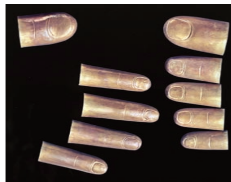
Gold finger and toe stalls