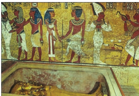
North wall showing the next three encounters in the king's journey after death.